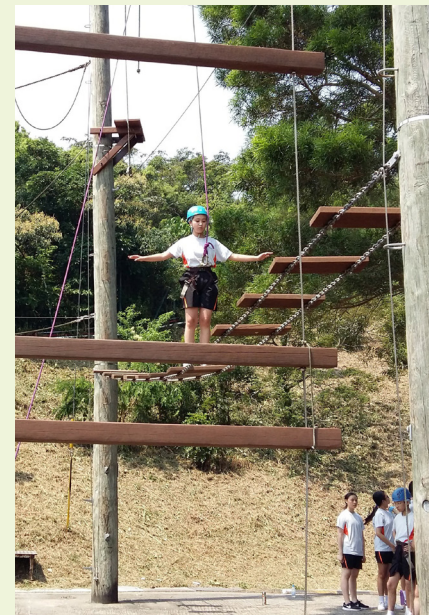
High Event 2: Stay calm, friend!