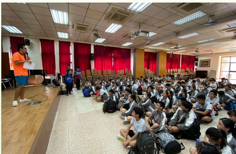
All ears--listening to the campsite briefing

In this camp, I learnt that there are things we might think we would fail to do; but after we try it, we can still do it, so I think we should have faith in ourselves in order to succeed. What's more, teamwork is very important. So if you feel like you are really unable to do it even if you have tried, you can look at the people around you to help you. Together, a team can create unimaginable power and strength that one has never experienced before.