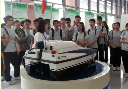
A tour explaining the research projects conducted by the institute

A one-day tour to the Greater Bay Area was arranged to enrich our students’ learning experience and let them understand the latest development of the region.