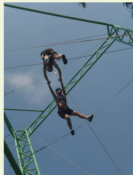
Doing a "High V"