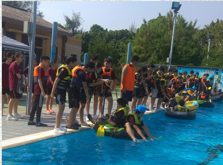
Rowing to the other side of the pool