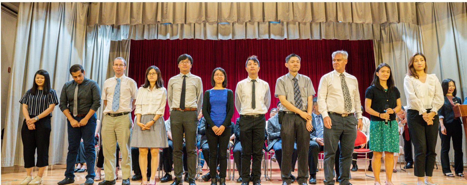
Introducing G.T. English Language Teachers of the year