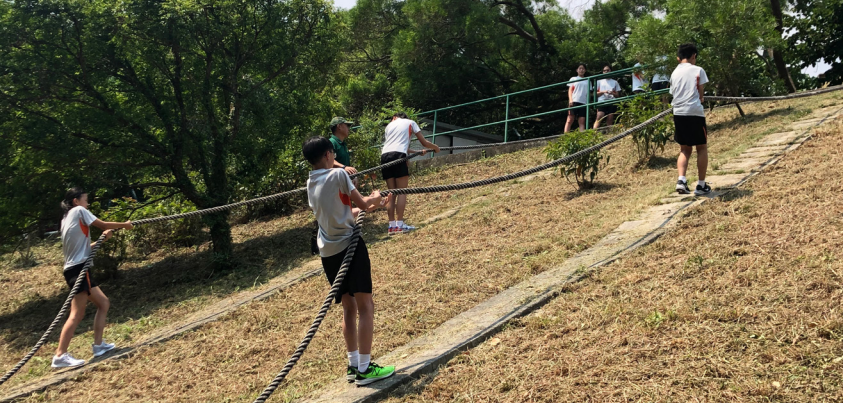
Obstacle Course 2: Unity is strength!