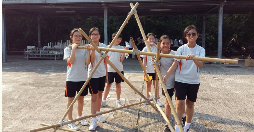
Building a Catapult: GT girls've got talent!