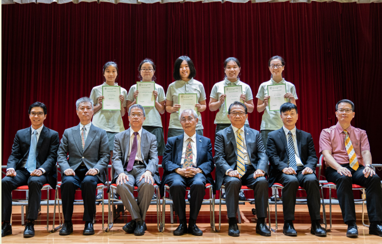
G11 Conduct Award Winners showing off their certificates