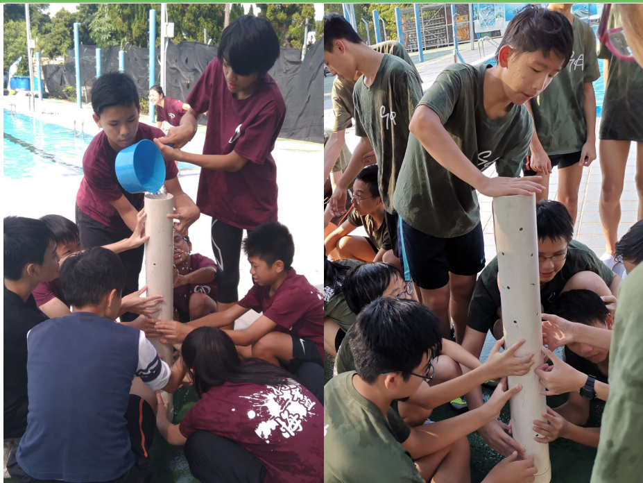
Two teams finding out the ball inside the pillar with hole

In this camp, I found my courage. In High V, I thought I had a valour to go up and go outside. The most important is I never screamed at all. This is a very good try. Also, I set a goal before I played High V. This is my first time to set a goal to play any games.