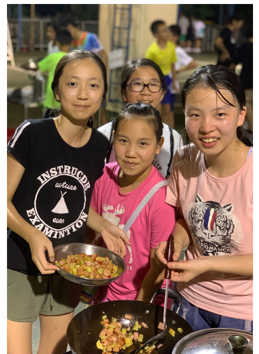
Being Master Chef is no easy job