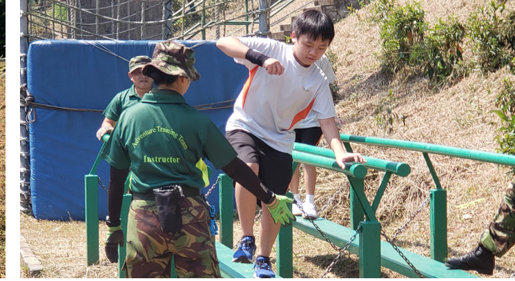
Obstacle Course 3: Everyone becoming a warrior!

The activities were challenging and meaningful. It pushed me to overcome the fear of heights and death, making me self-disciplined and independent. I was not afraid of any activities with my newly gained self-confidence.