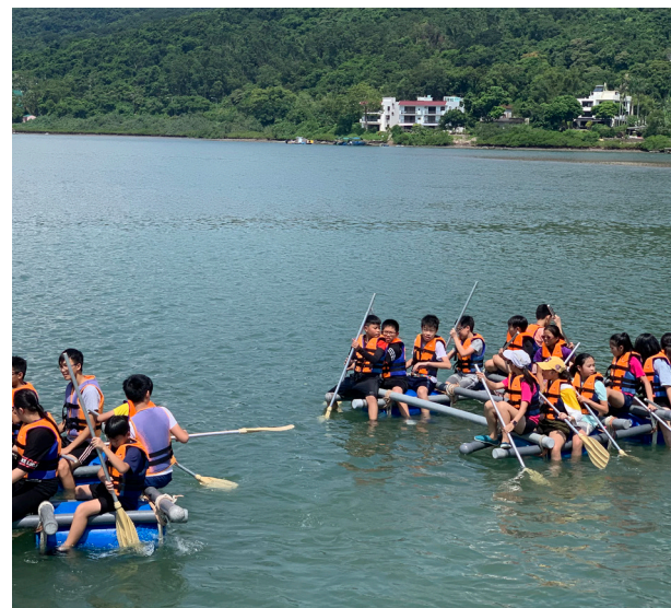
Row, row, row the boat!

I was afraid to walk along the rope hanging on the roof. My partner encouraged me in the process. Finally, I could finish the task with my partner. After finishing this task, I understood that determination and believing in myself are important elements I need to accomplish different missions in the future.