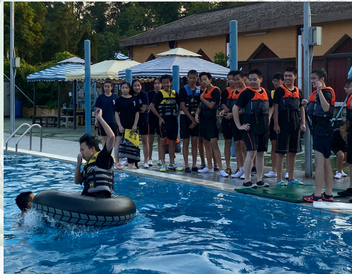
Jumping into the blister on top of the water