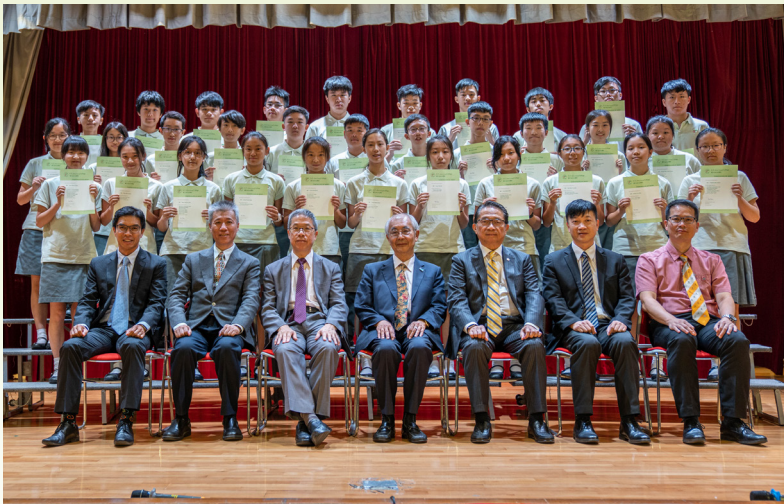
G9 Academic Award Winners reaping their rewards of being diligent