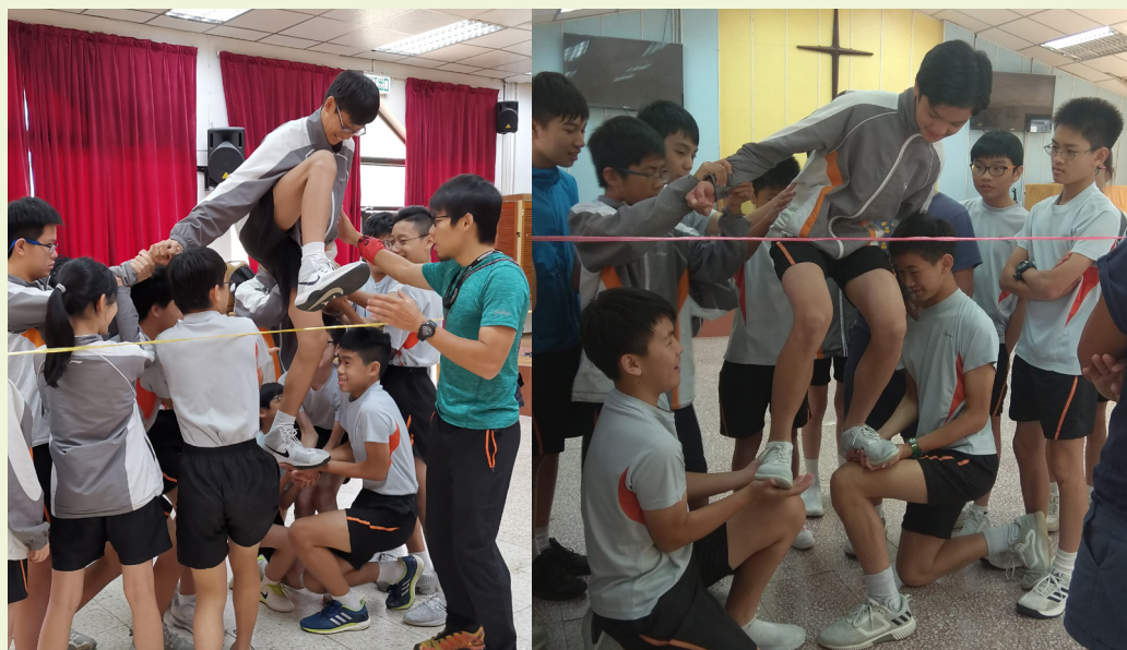
Crossing the "electric fence" only on top of the rope