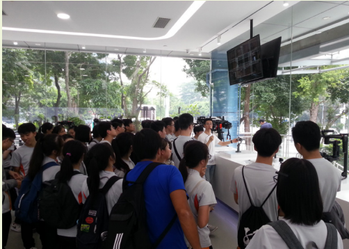
Students exploring the latest products of DJI