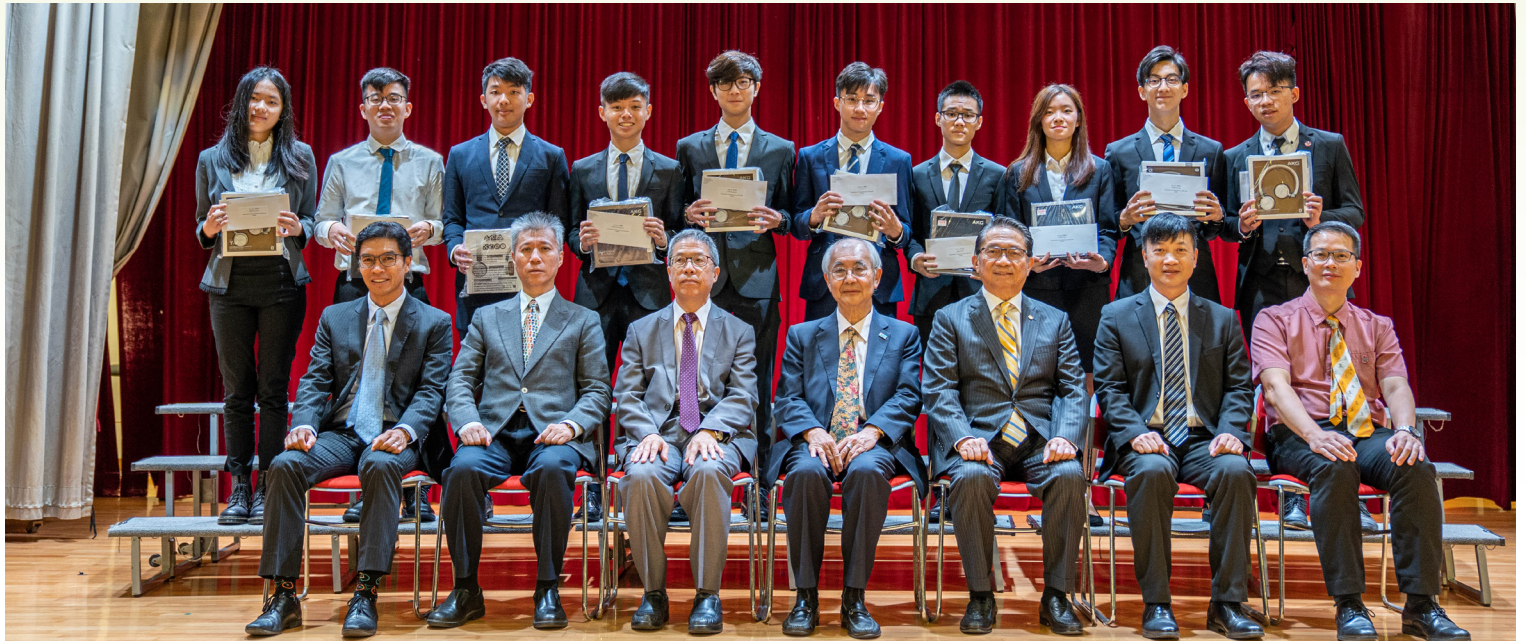
Presenting the University Entrance Scholarship to graduates admitted to Science Programmes