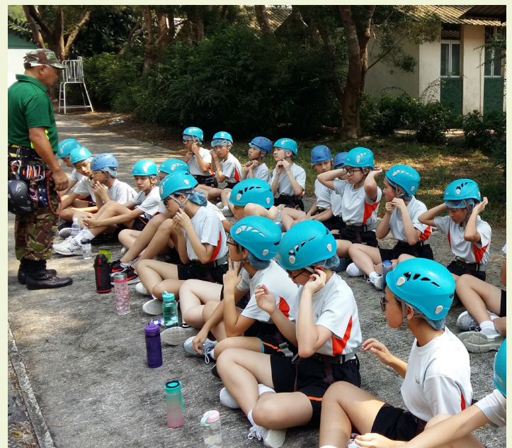
Gearing up for the High Event!