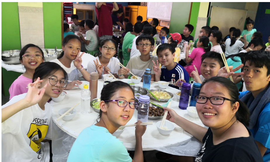
Let's eat, buddies!