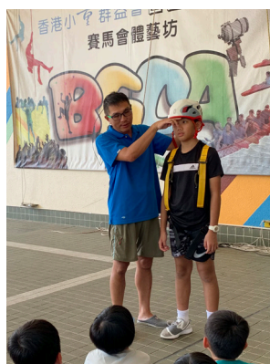
Safety being our priority!