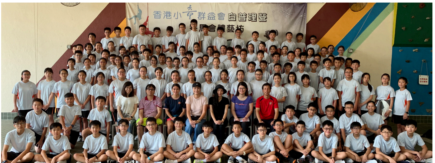
Teachers and G7 students taking a group photo at the campsite