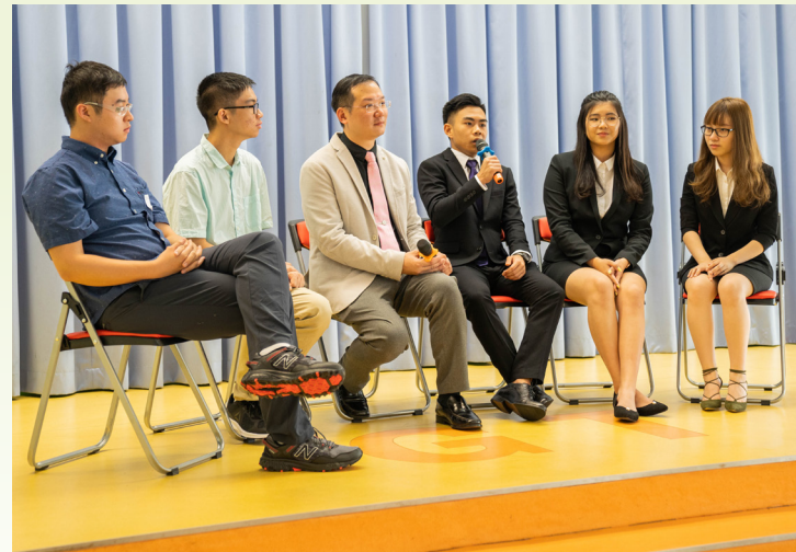
2019 DSE graduate representatives sharing their experience with G12 students