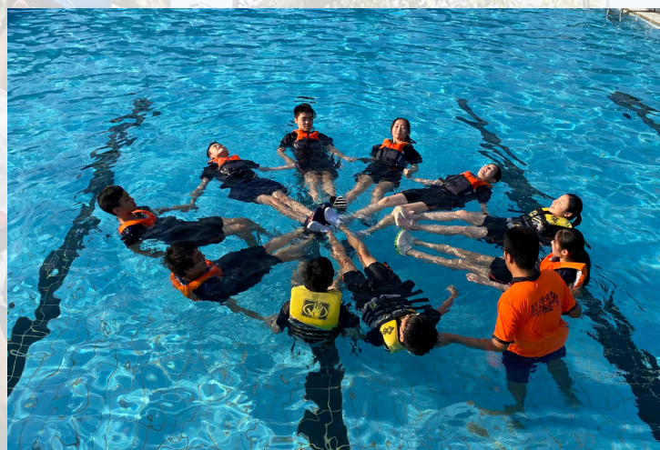
Warming up in the water makes a flower

I learnt that communication and cooperation are very important within a team; throughout communication, we worked out a plan to best help our classmates. Through interaction, we calmed down our classmates who were afraid of heights. As a result, we pulled off the activities, teamwork has made our job easier.