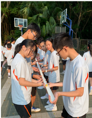
Working as a team