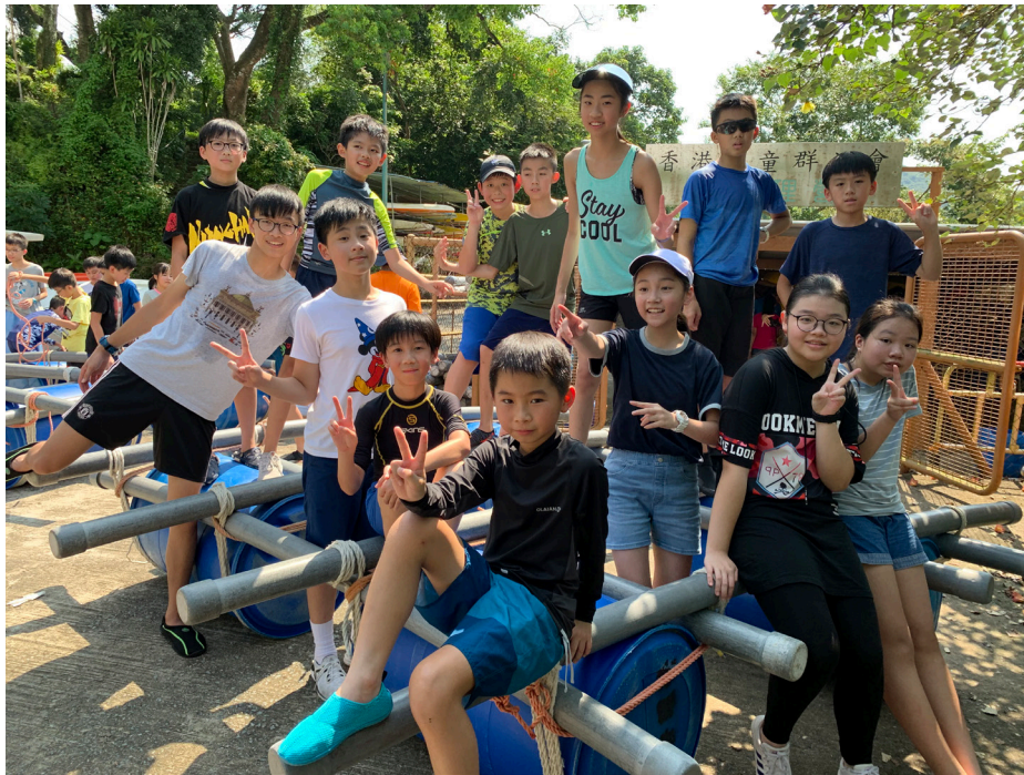
Yeah! We have made it!