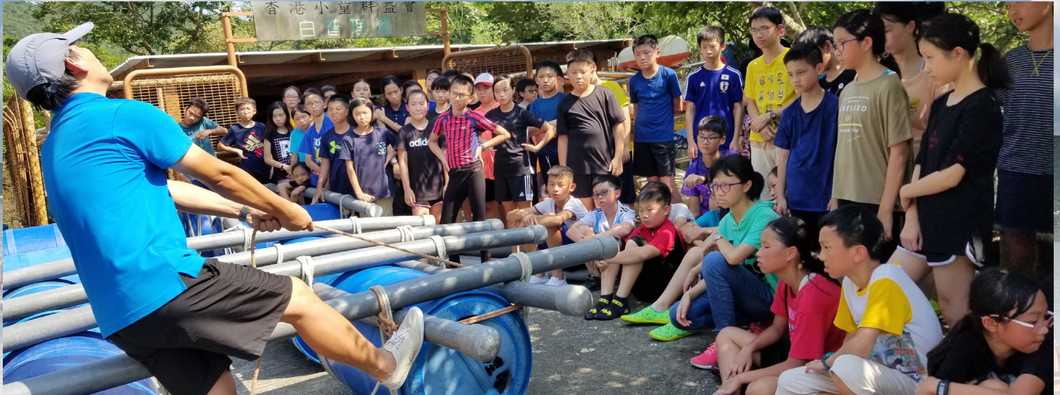
Demonstrating the making of a bamboo raft