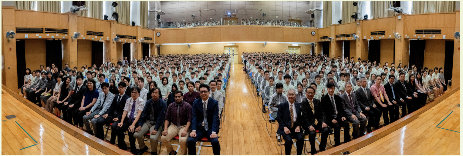
Taking a group photo after the Prize Giving Ceremony