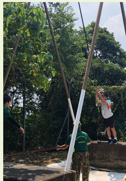
Obstacle Course 4: Oh! My God!