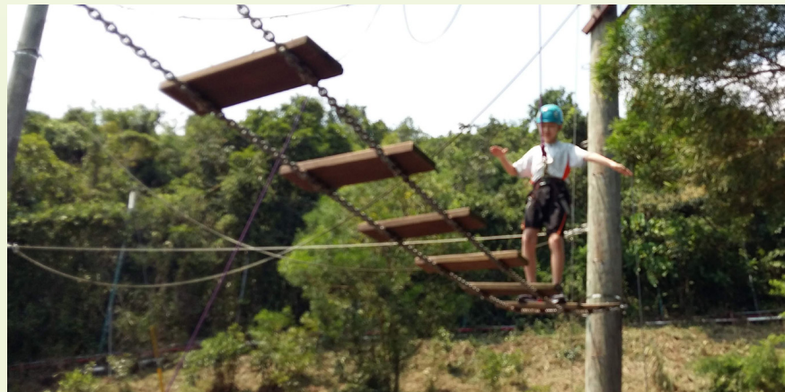
High Event 1: Oh! Such a long way to go!