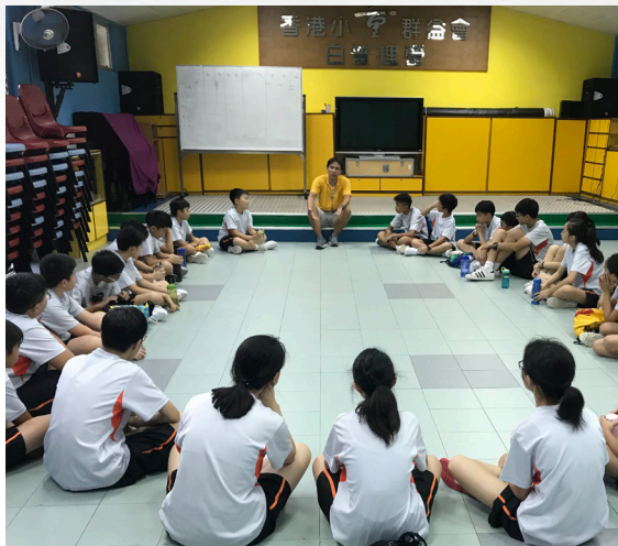
Conducting a debriefing and sharing session

In our team, every member had different strengths and limitations. For example, I did not know how to knot and I am strong enough to assist the team to finish the tasks that require physical strength. Other members could also be good leaders and provide guidance for the team. Although we have different limitations, every member can make significant contributions to the team's performance.