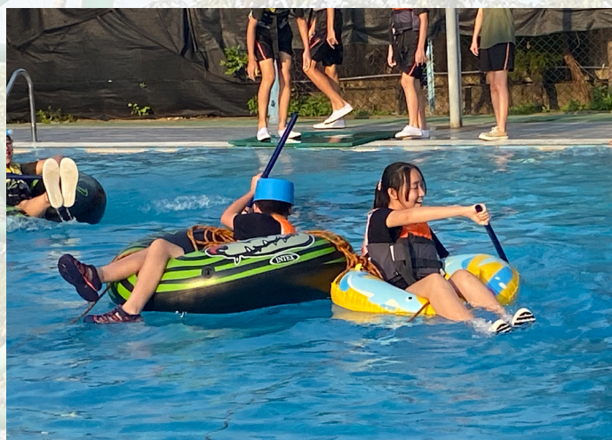
Two teams competing to the finishing line