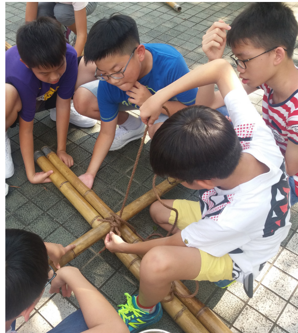
Go, go, go; just do it!