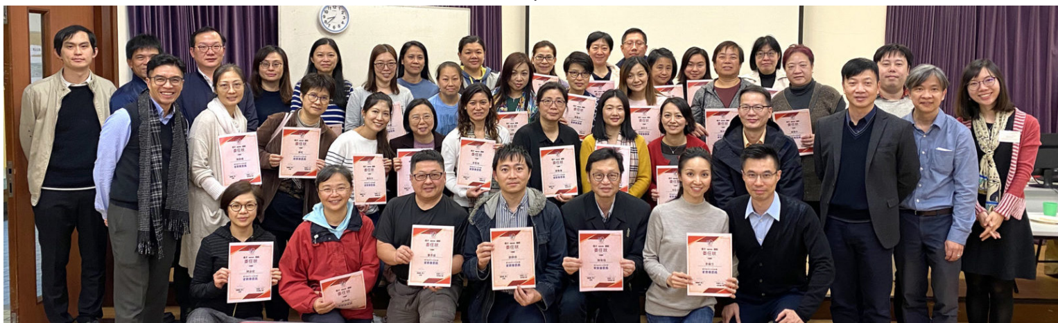
Parent representatives receiving certificates of appreciation