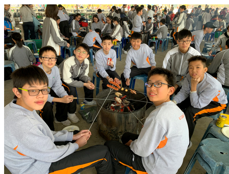
G7 students gathering around the grill