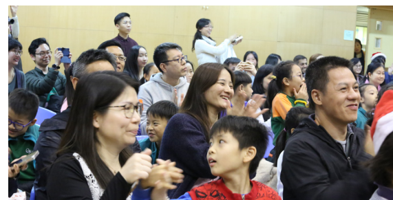
Parents and other audiences giving their round of applause