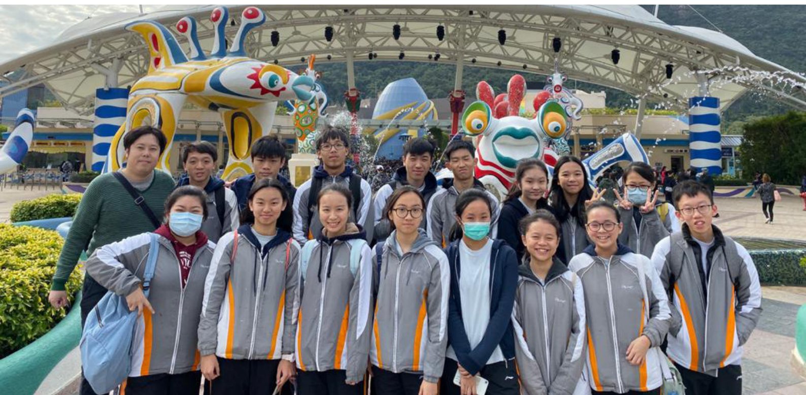
G10A taking a "family" photo