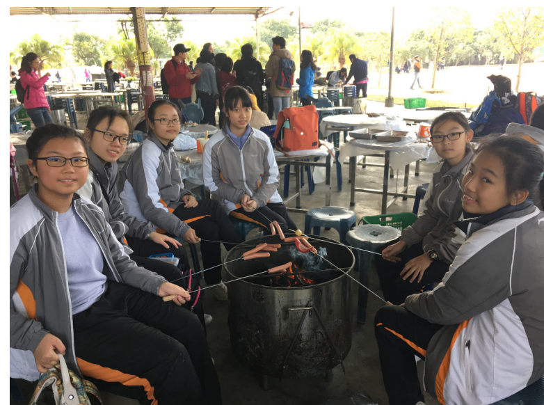
G8 students awaiting their scrumptious meal