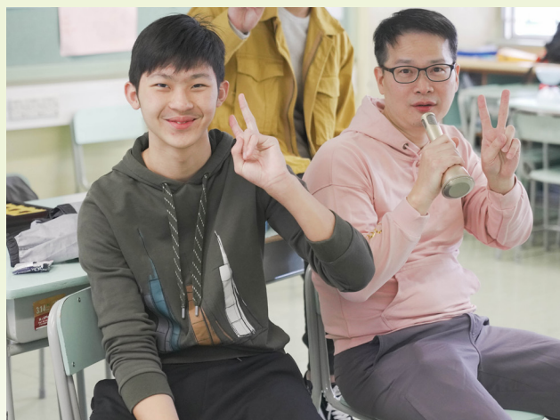
Teachers working together with students in games