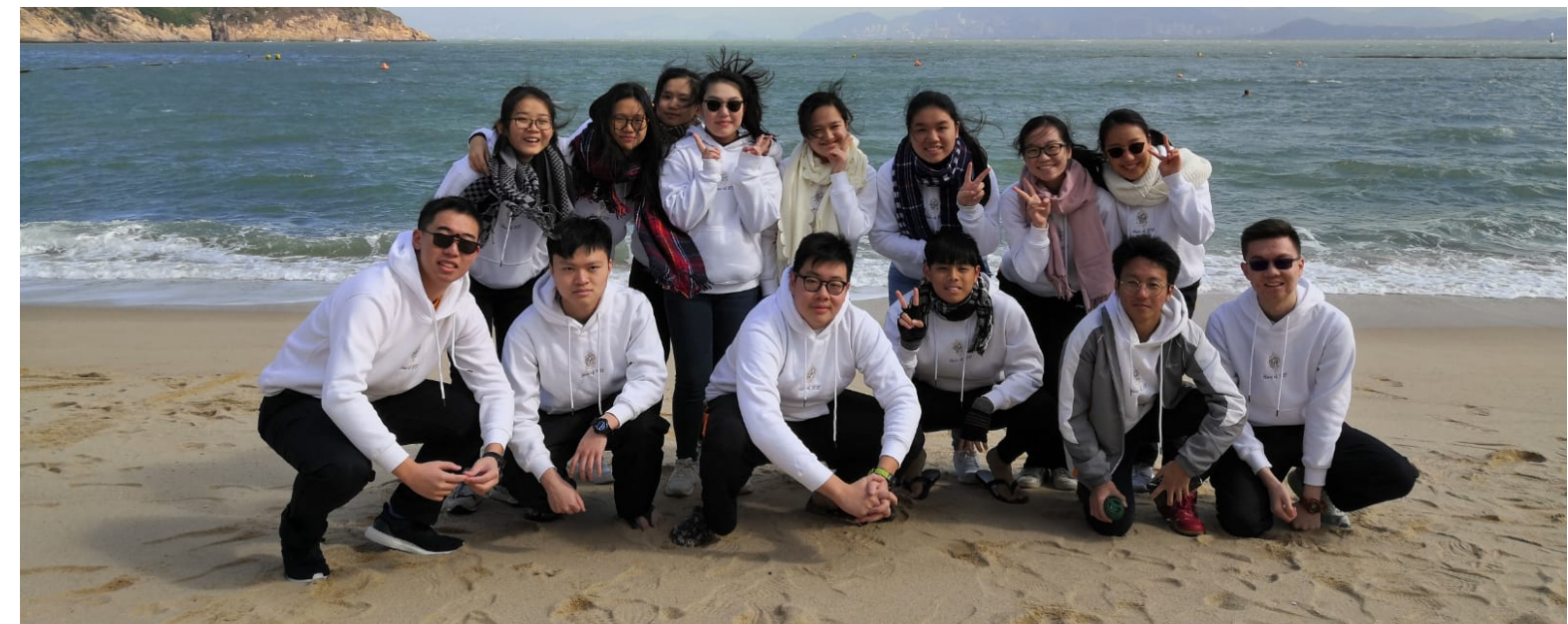
G12A relishing the company of their friends