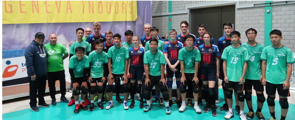
Our boys' team taking a group photo with the Switzerland team before vying for the M18 championship