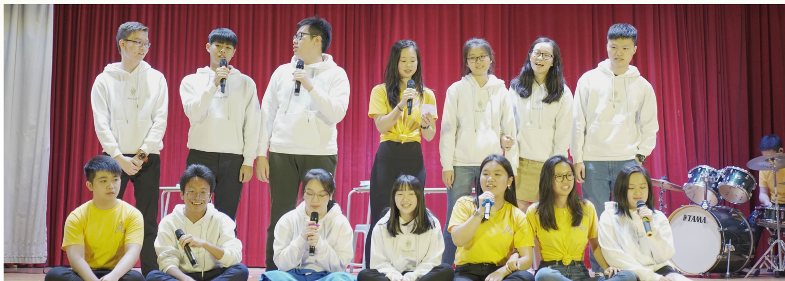
G12A performing their “Waiting for Godot”