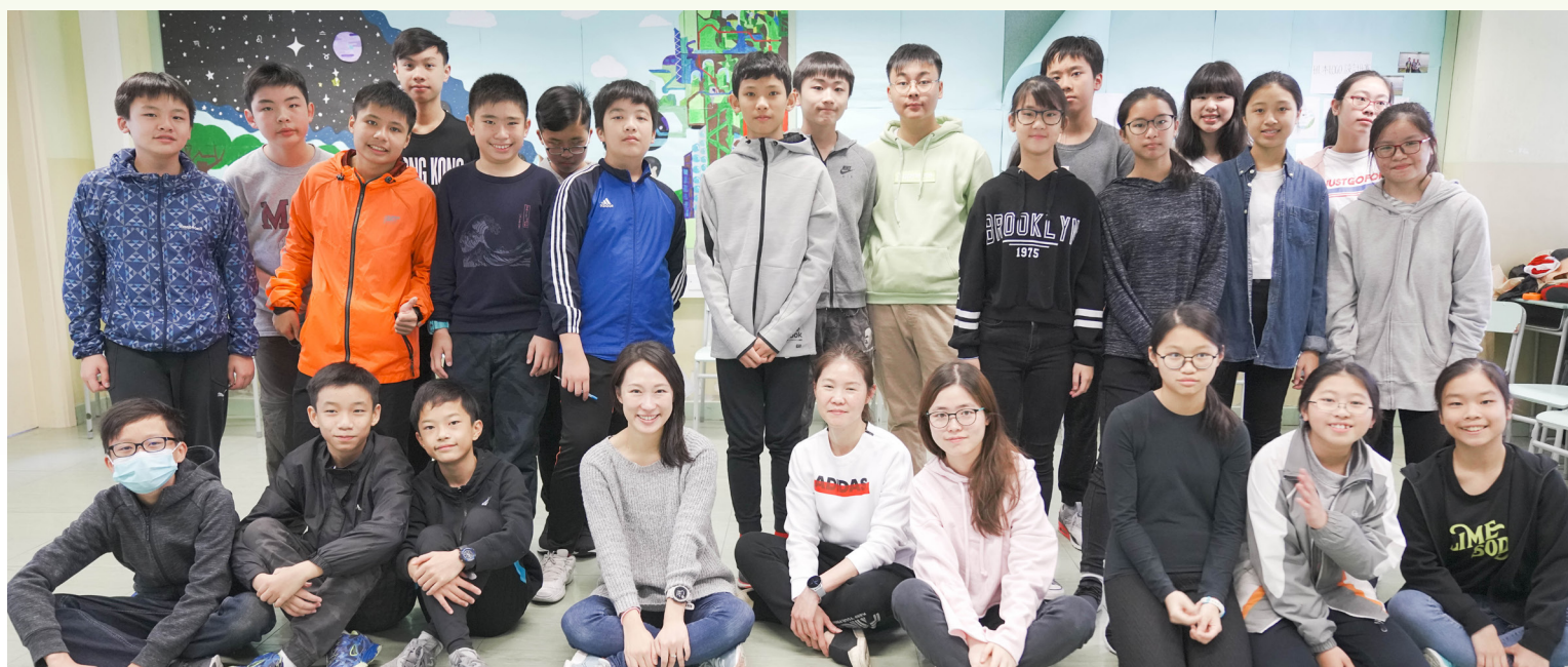
G8D students having a great time at the Christmas party