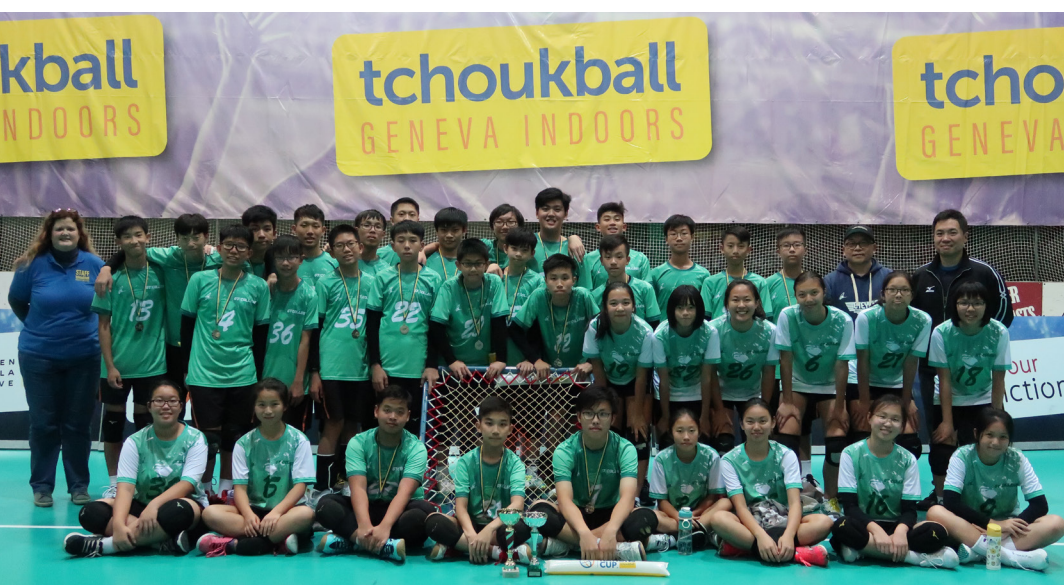
Our teams being the first runners-up in boys M15 and M18 in Tchoukball Geneva Indoors

I am very grateful to have this opportunity to go to Switzerland and to have participated in the Geneva Indoors Tchoukball Competition. Not only did I learn a lot of tchoukball skills but I also experienced the culture of Switzerland; I enjoyed the astonishing view and met a lot of foreign tchoukball players. The trip has also encouraged us to persist in advancing our tchoukball skills and aiming for better results in the future.