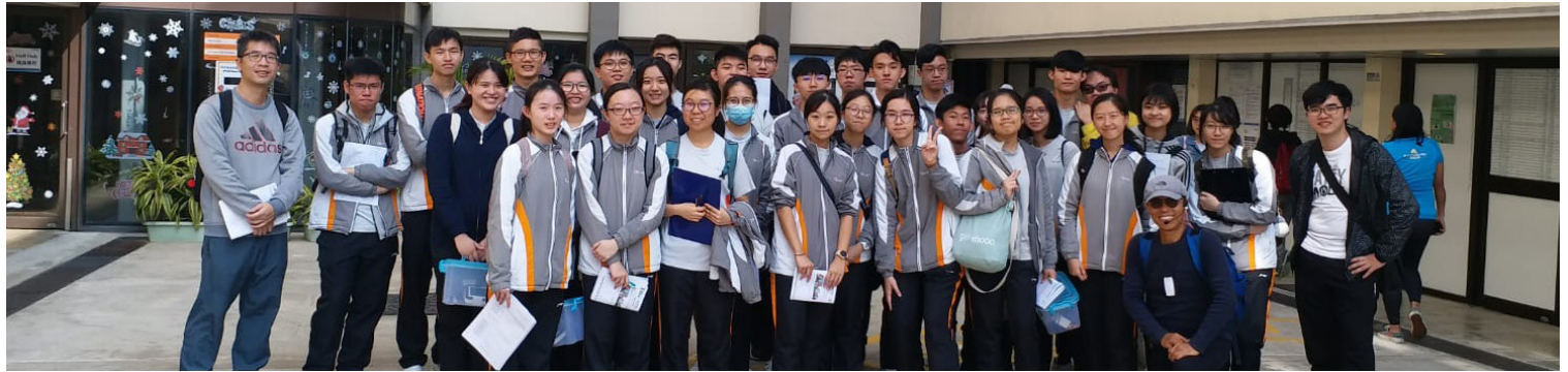
G11 Geog students in great expectation about Mei Ho House