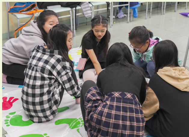
Students playing a team building game