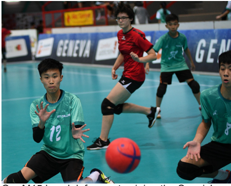
Our M15 boys' defense stymieing the Spanish high-powered offense in the tiebreak