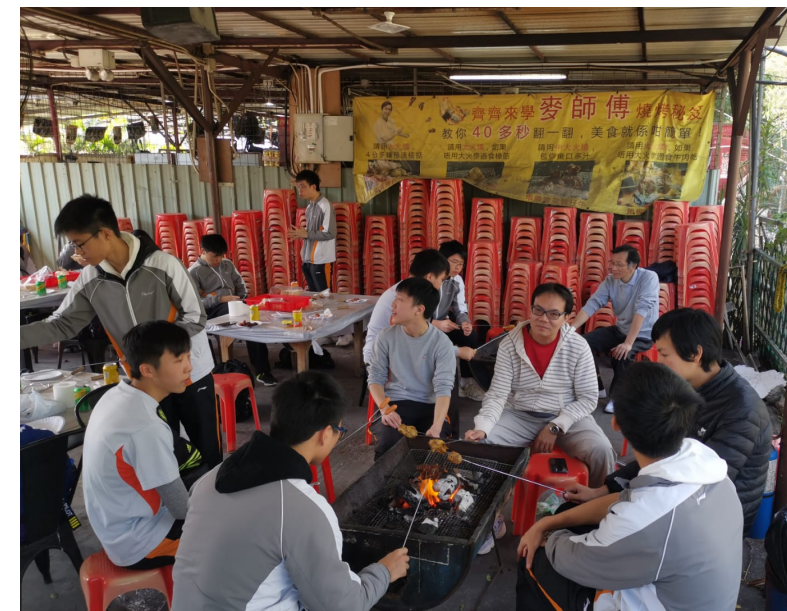
G11 students barbecuing with their teacher