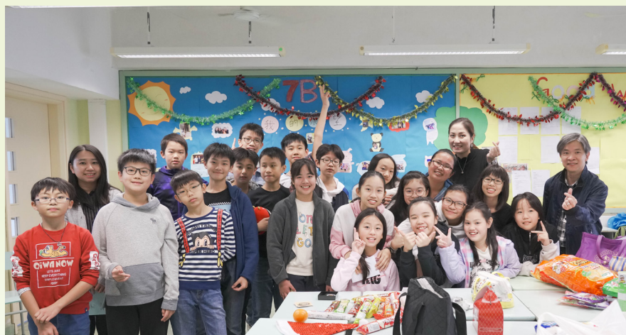
Class 7B enjoying their Christmas party at GT