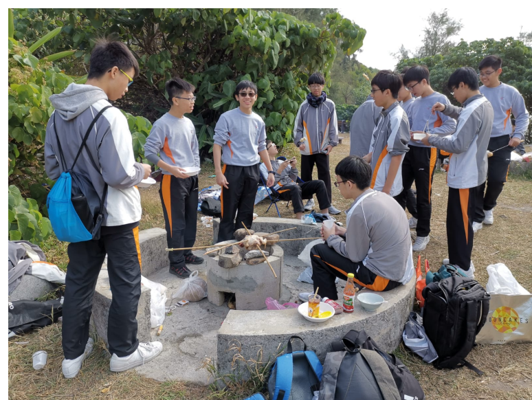
G9 students watching the performance of their master chef