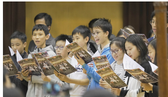
Teachers and choir members enjoying their oneness