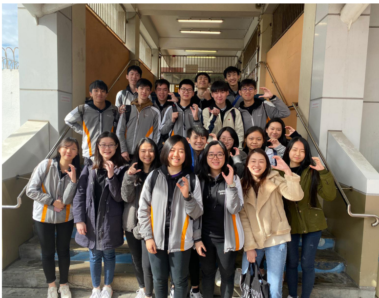
G12C striking their pose