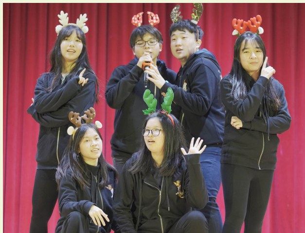
2nd runners-up of the “Most Loved Singers”