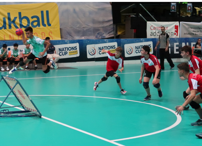
Students benefiting tremendously from experiencing an international competition in Switzerland for the first time