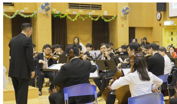
GT Orchestra performing with guest musicians