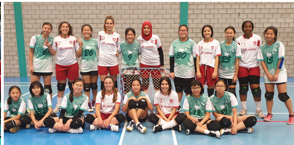
Our girls' team enjoying their time with their new friends from Tunisia