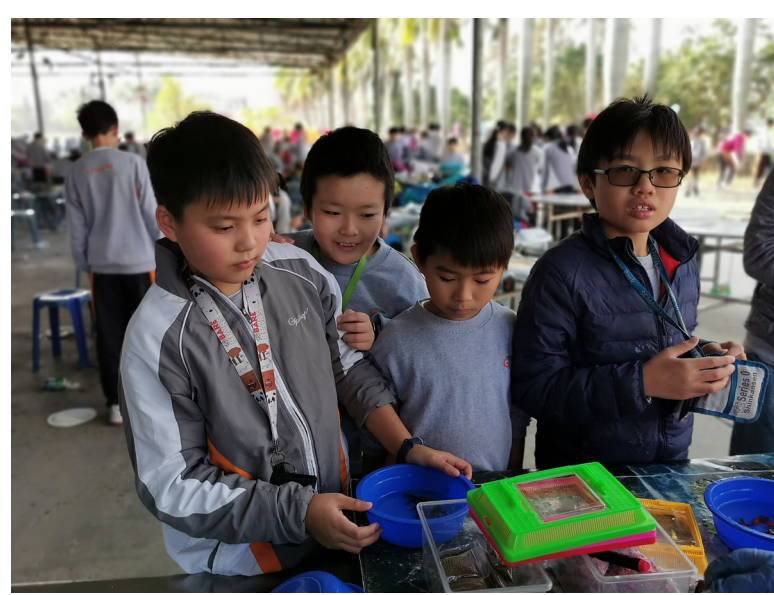
G7s looking at the food in anticipation