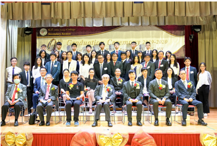
Group photo of 12C graduates and teachers