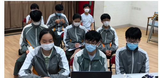
No.2 candidate Originator delivering their election platform