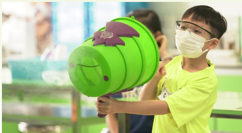
Students enjoying the science activities

The Admission Briefing was held on 31 Oct 2020 (SAT). The function is designed for parents and students from outside to know more about GT. On that day, parents gathered at our school hall and various information was disseminated in different ways such as presentation, sharing and Q&A session.