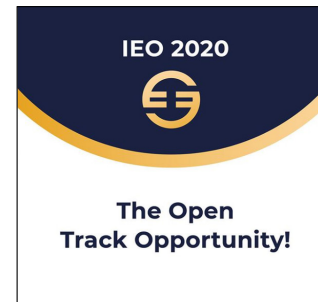
The International Economics Olympiad (IEO)