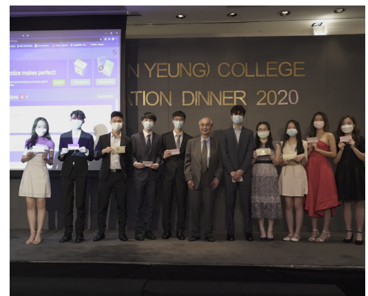
Winners of the Kahoot quiz in the dinner