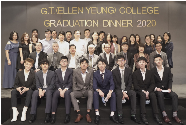
Class photo of 12C: Nothing better than the reunion