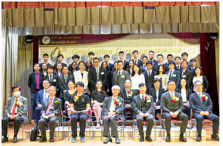
Group photo of 12D graduates and teachers