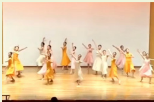
Online opening ceremony

This year, Ritsumeikan High School in Japan arranged the “Rits Super Global Forum 2020 Online (RSGF 2020 Online)” with the aim of solving global issues. Our students had a chance to discuss and collaborate with other students from different nations.