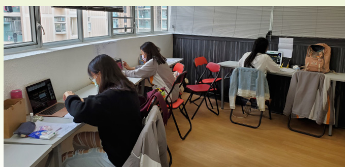
G.T. students engaging in a discussion in the forum