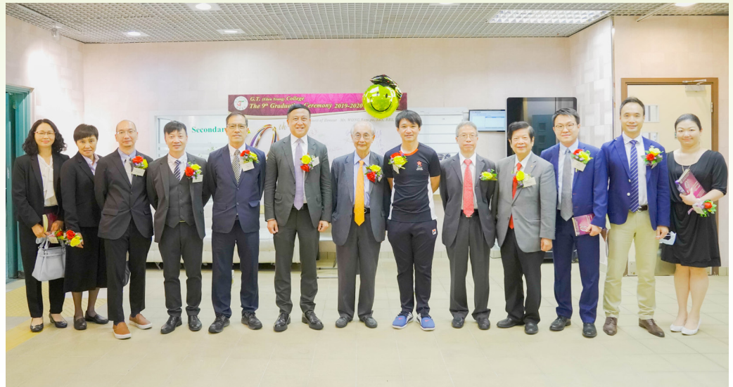
Group photo of guests and governors of G.T. college