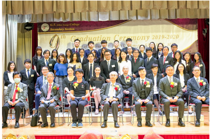
Group photo of 12B graduates and teachers