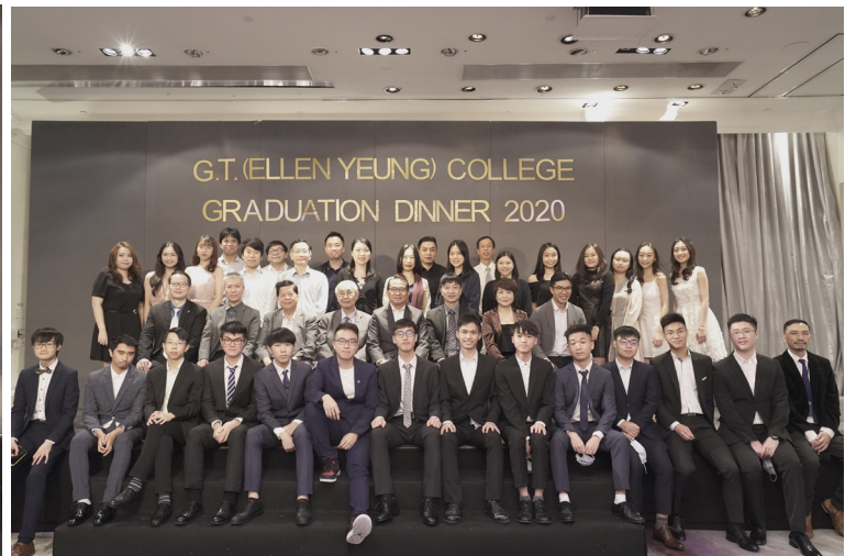
Class photo of 12D: Here we are—men's power (in the front row)