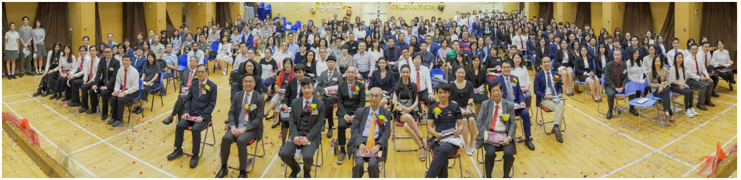
Group photo at the end of the graduation ceremony: The "Great Expectation" of the Year