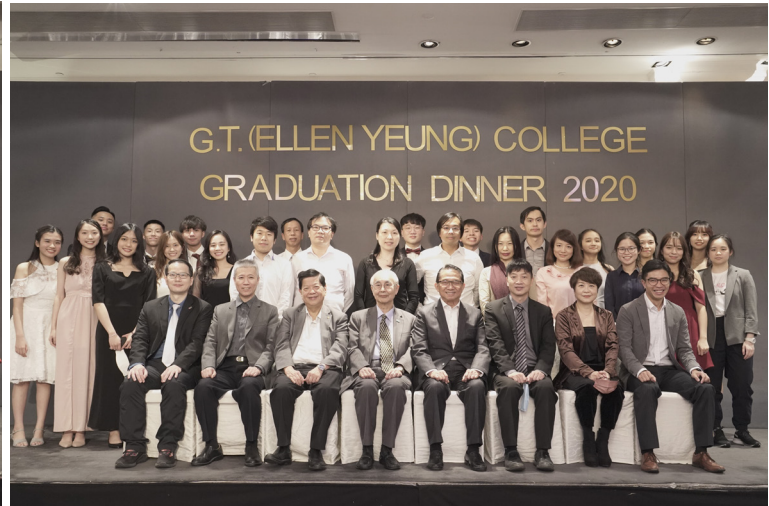
Class photo of 12B: The chance is for those who wait