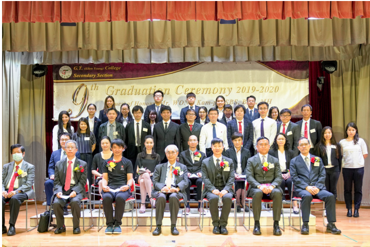
Group photo of 12A graduates and teachers