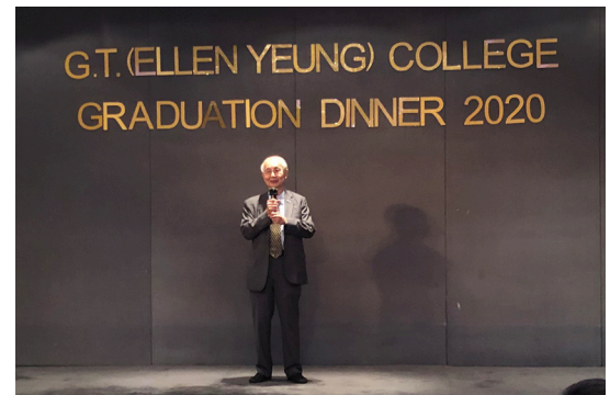
Mr. Desmond Lee giving a speech at the graduation dinner