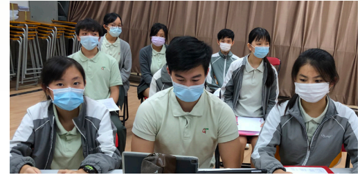
No.1 candidate Symphony answering students' questions