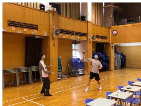
Testing the calculated results of the badminton motion