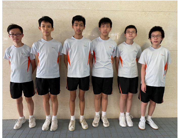
The students who took part in the IJSO- the budding scientists