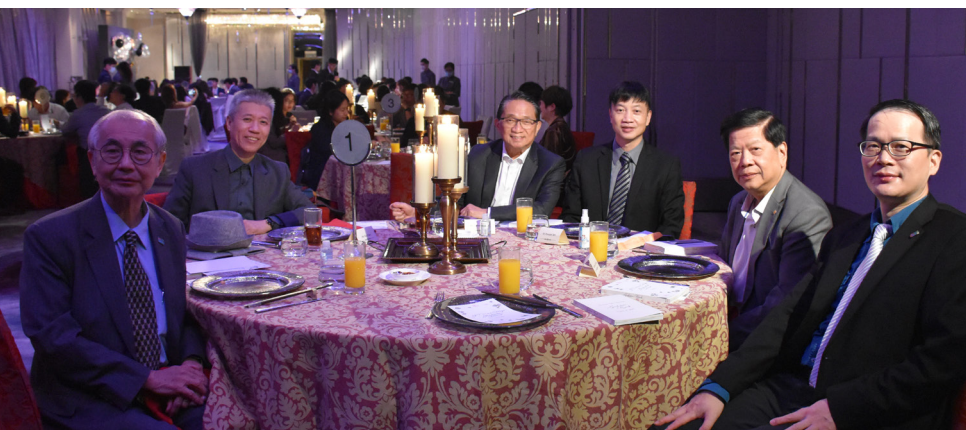
Honourable guests at the graduation dinner