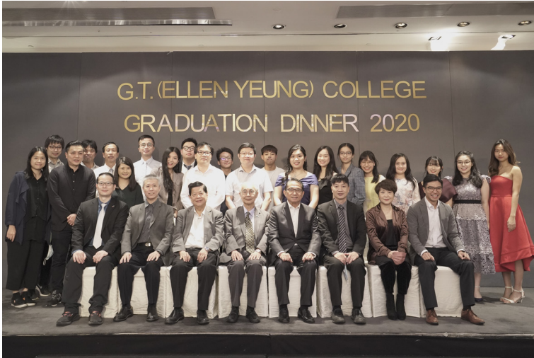
Class photo of 12A: Finally this is our dinner