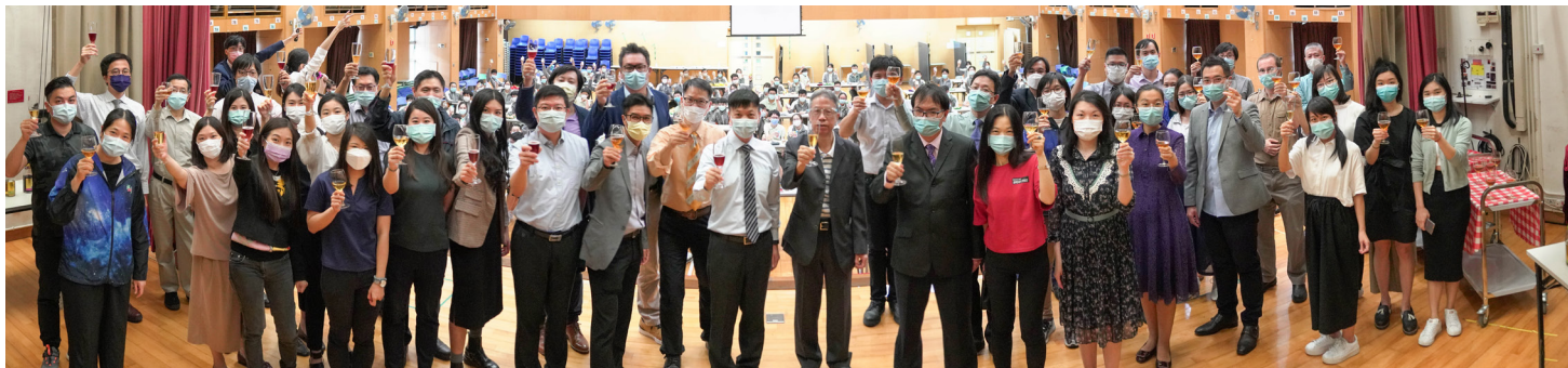
Teachers and the management team toasting on stage