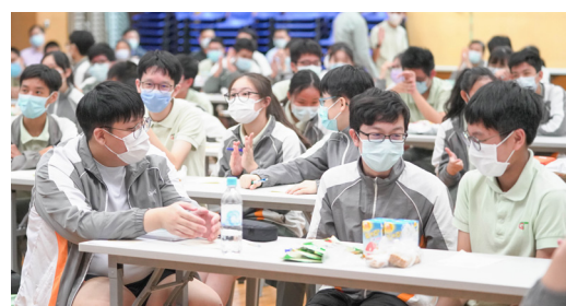
Grade 10 students having fun with Bingo game