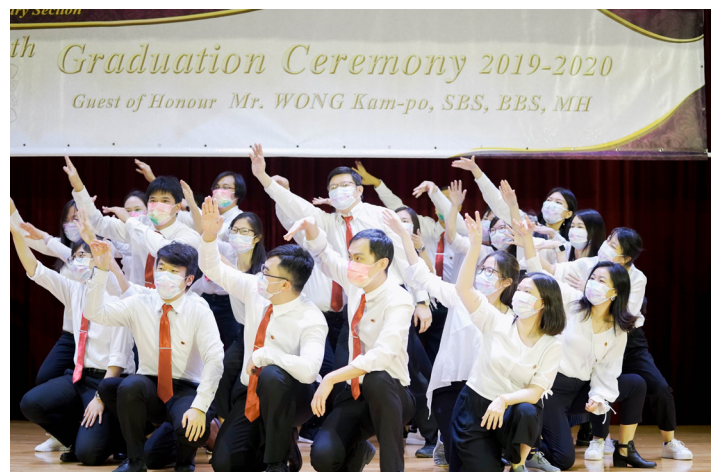
G.T. teachers' "High" School Musical