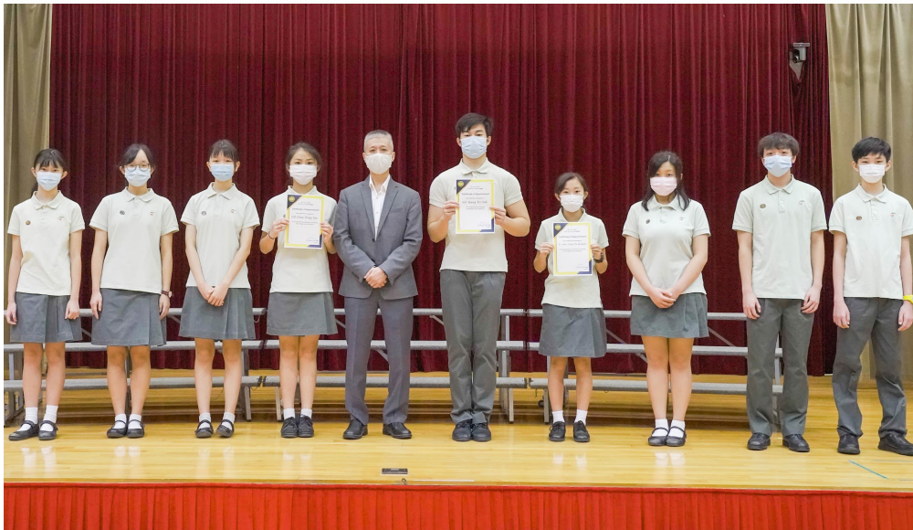
The Committee Members of the 9th Student Union

The External Affairs Officer of the 8th Student Union (9F)