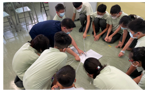
All on the floor in a team building activity