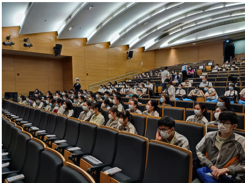
Our prefects benefiting from the honourable guests' sharing