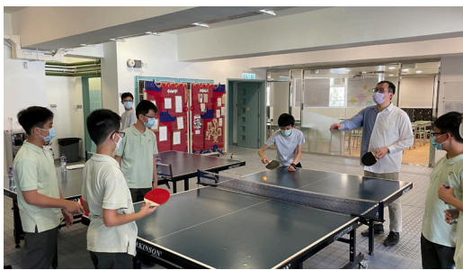
All joy in Campus Treasure Hunt 1