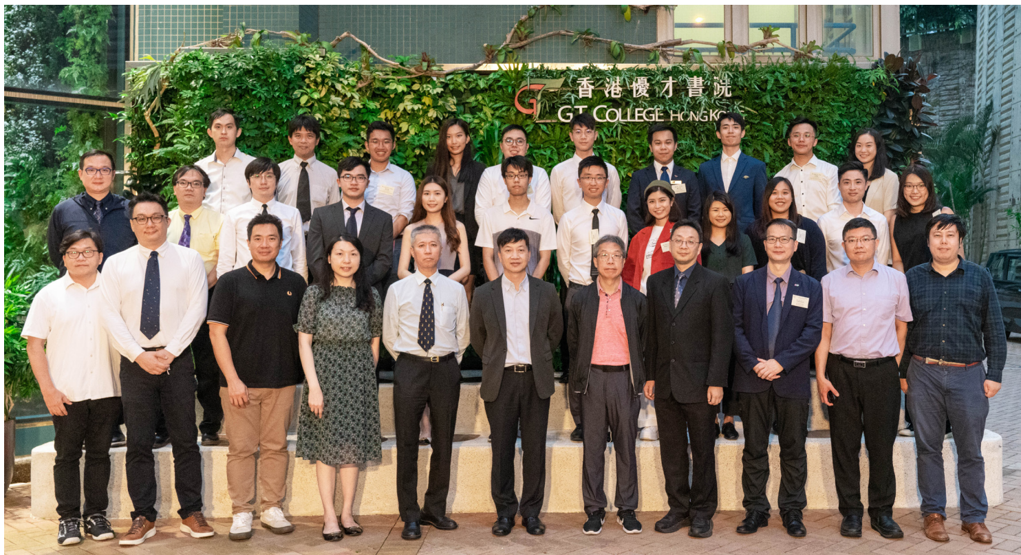
Alumni taking photos with school management team and experienced teachers

On 29 September 2021, the Alumni Association held the Career and University Consultation Night for G12 students and parents. We invited 21 alumni to share their working experience and professional development after graduation. We had designed three parallel talks with different domains in which the G12 students could participate according to their favourite subjects. Group A is about “Science and Medicine” including Physiotherapy, Computer Science, Mathematics, Veterinary Medicine, Biochemistry and Medicine. Group B concerns “Business and Social Science” including Accounting, Finance, Environmental Management & Technology and Global Health & Development. In Group C, there are talks about “Arts & Social Science” including Journal Art, Education, Design, Linguistics & Translation, and German & European Studies.