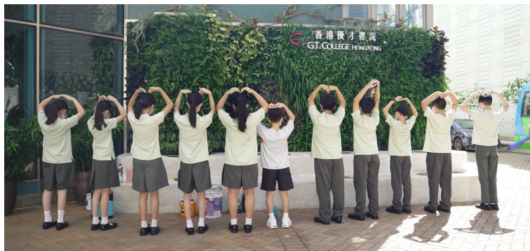
All hands up in Campus Treasure Hunt 2

The G7 Integration Programme was successfully held on 17 August 2021. Through ice-breaking activities and Campus Treasure Hunt, students were more familiar with the school environment. Those activities encouraged the interaction between G7 students and their class teachers. Students developed a closer relationship with their classmates and met a lot of new friends. All G7 students experienced a fruitful and cheerful moment that afternoon.