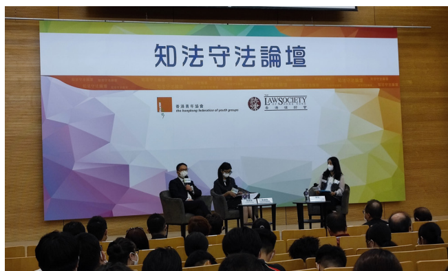
The speakers emphasising the significant role of laws in society