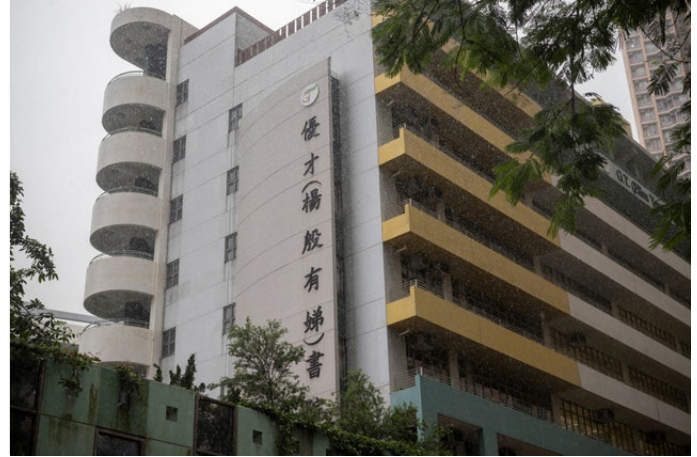
優才 (楊殷有娣) 書院。

該校在2018年2月獲國際文憑組織 (IBO) 認證，獲授權開辦IBDP課程，同年9月的中五正式開班，學額約20個，全年學費為$85,580。