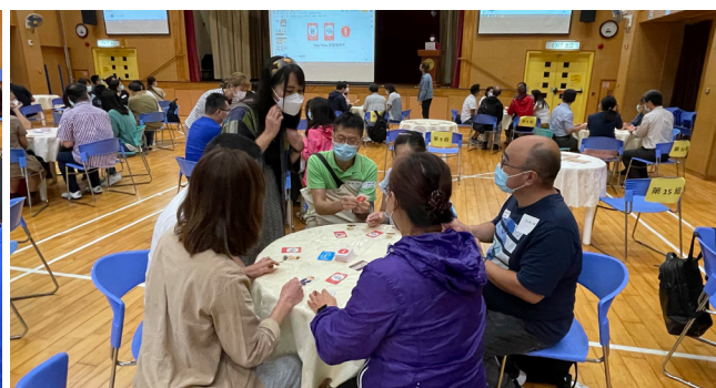
Parents getting to know the concept of the family board game