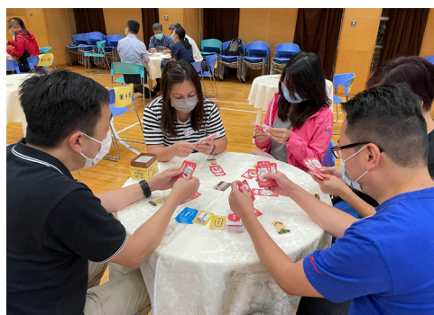
Parents playing the family board game