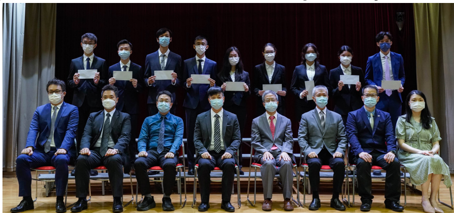
Graduates 2020-2021 receiving University Entrance Scholarships and Outstanding Scholarships