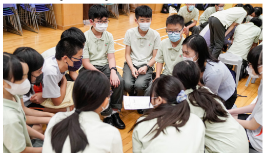
Group sharing after the activities