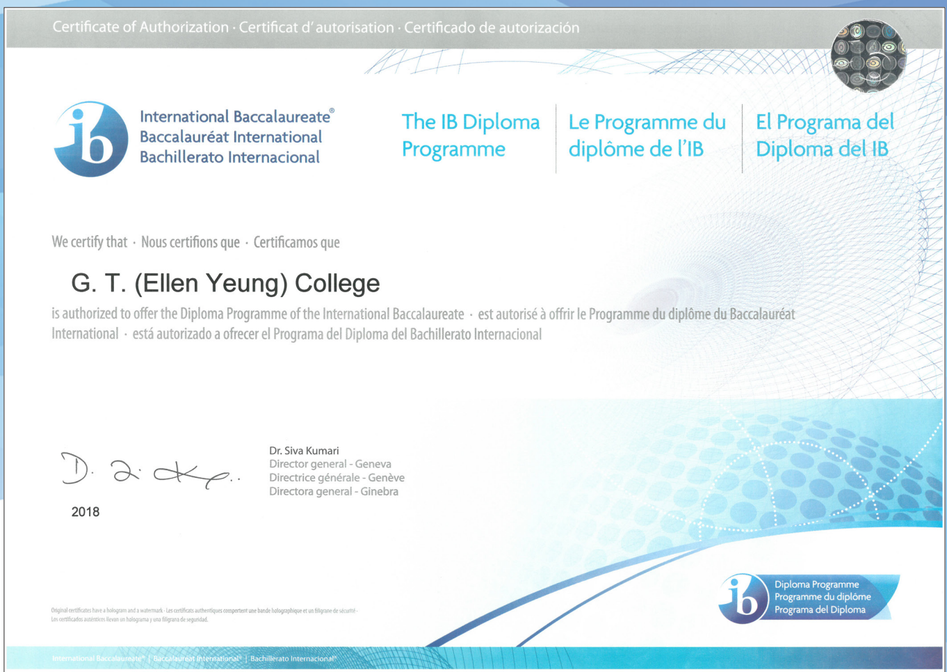
The official certificate of authorisation for the IBDP